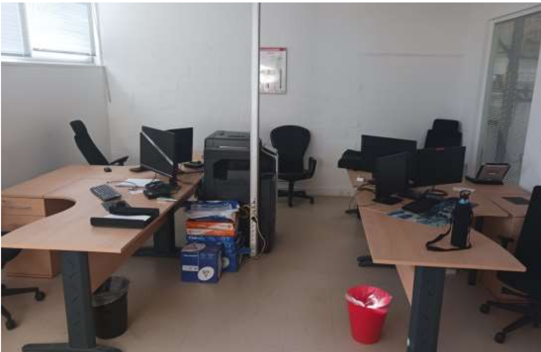
- Technician Office (shop floor - #9)