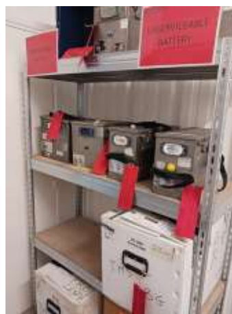
- Battery Storage (shop floor - #17)