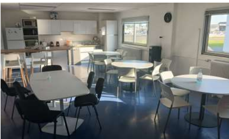
- Kitchen (1 st floor - #8)