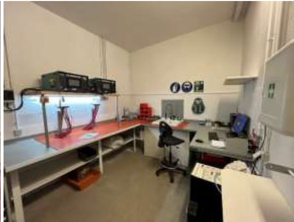
Nicad (shop floor - #16)