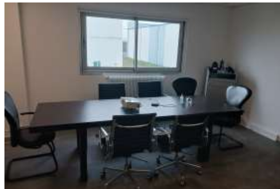
-Meeting room (1 st floor - #1)