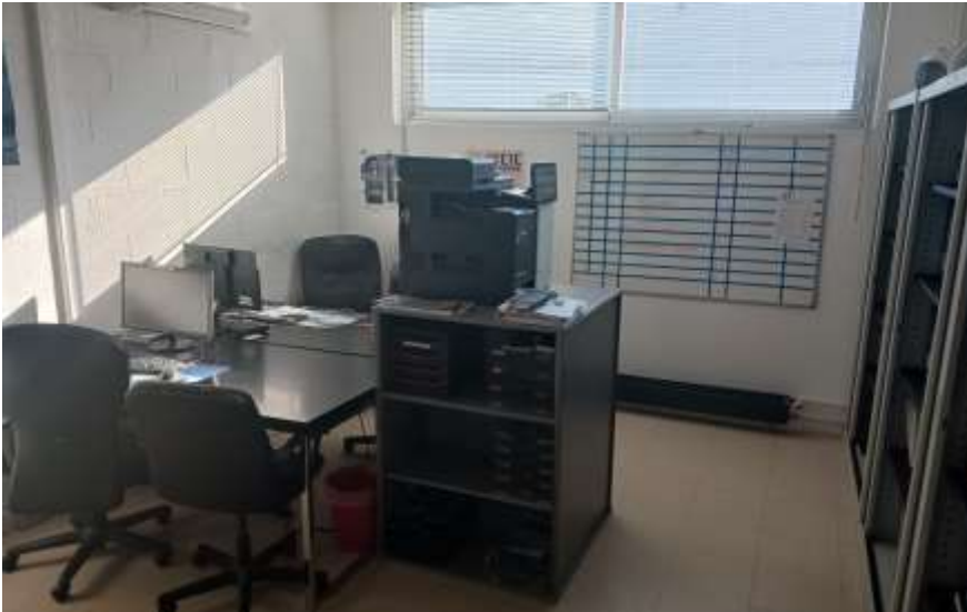
-Management Office(shop floor – #8)