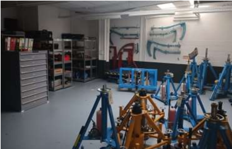
Tools and GSE (shop floor - #14)