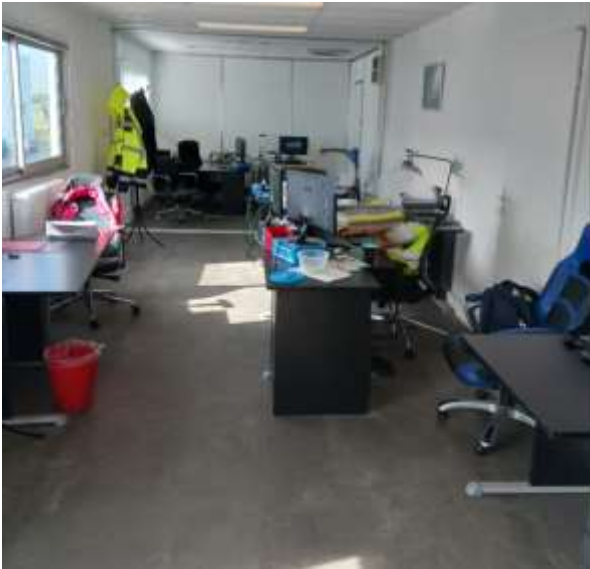
-Technical services (1 st floor - #3&4)