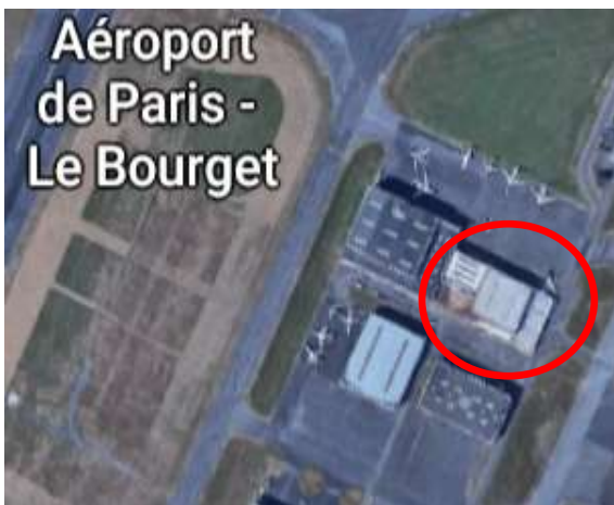
Offices + Hangar (362) & Technical Area